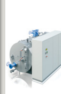
PARAT MEL-C Low Voltage Boiler