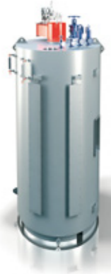
PARAT MTW Top-Fired Water Tube Boiler