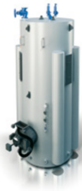
PARAT MVW Water Tube Boiler

Pressure jet, rotary cup or steam atomizing burner for HFO, MDO, MGO, LNG or Multifuel. Side-fired.