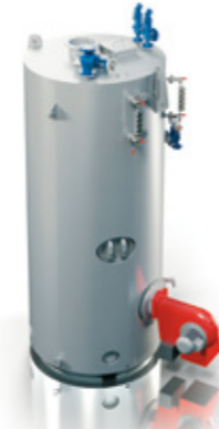
PARAT MVS Smoke Tube Boiler

Pressure jet, rotary cup or steam atomizing burner for HFO, MDO, MGO, LNG or Multifuel. Side-fired.