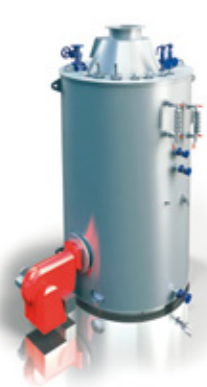
PARAT MPW Vertical Pin-Tube Boiler

Burner for HFO, MDO, MGO, LNG or Multifuel. Top-fired.