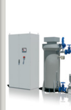
PARAT ECS Electrical Circulation Steam Boiler