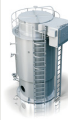
PARAT MEH High Voltage Electrode Boiler