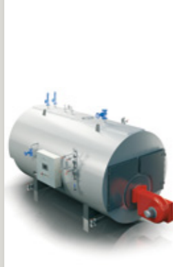
PARAT MSH Horizontal Smoke Tube Boiler

Pressure jet or rotary cup burner for HFO, MDO, MGO, LNG or Multifuel. Side-fired.