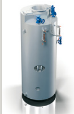
PARAT MES Smoke Tube WHRU

Bare tube or finned tube dependent on operating characteristics.