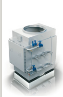
PARAT MEW Water Tube Waste Heat Recovery

Standard size range 50 - 400kW. Other sizes upon request.